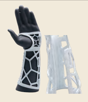
Data Courtesy of Castomade