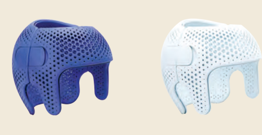
Data Courtesy of Invent Medical

This robust thermoplastic provides the best balance between performance and reusability,<sup>5</sup> for white functional parts across a variety of applications like prosthetics, medical equipment, lighting décor, fashion and wearables, and household appliances.