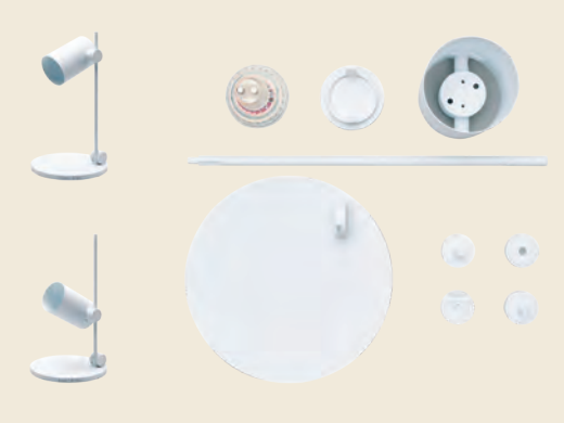
Data Courtesy of Ed Lighting