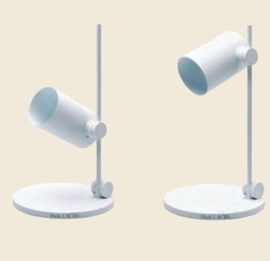
Data Courtesy of Ed Lighting